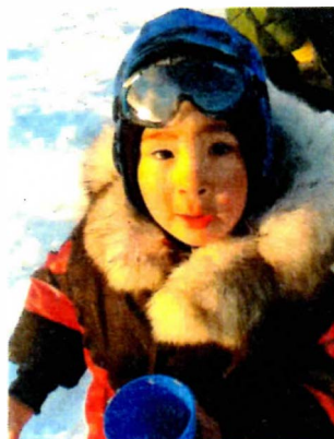
HAPPY LITTLE TRAVELER