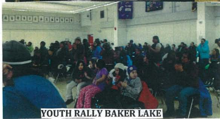
YOUTH RALLY BAKER LAKE