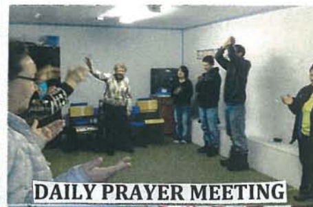
DAILY PRAYER MEETING