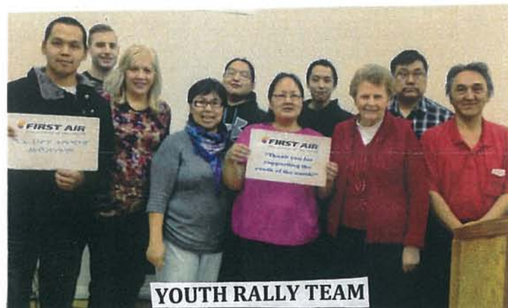
YOUTH RALLY TEAM