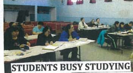
STUDENTS BUSY STUDYING

It is so exciting and rewarding to see these “on fire” Inuit taking up the torch of leadership today. Many have now returned to their villages and are busy for the Lord as worship leaders, youth leaders and ministering the Word. What an exciting time to see the glory of the Lord in these last days! We do count on your continued help and prayerful support to see many more Inuit reached for Jesus...for when we all work together, souls are won, and God receives the glory!